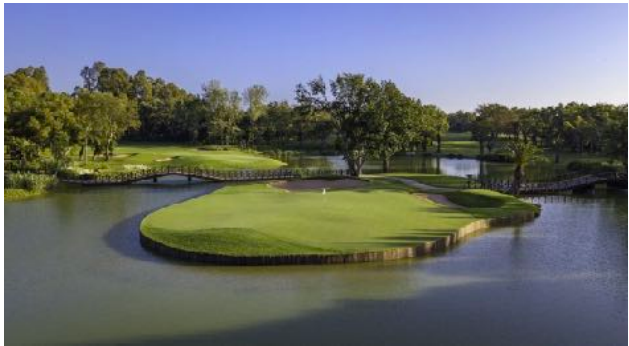
The Signature 9th Hole at Royal Golf Dar es Salaam Red

The golfing highlight will be a round at the Royal Golf Dar Essalam Red (“Rouge”) course, designed by Robert Trent Jones and completed in 1971. This is the flagship